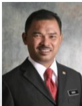
RT. HON. DATUK SERI IR. IDRIS HARON (Malaysia)