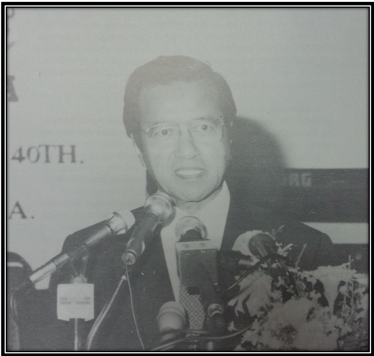
The Prime Minister of Malaysia Datuk Seri Dr. Mahathir Mohamad.