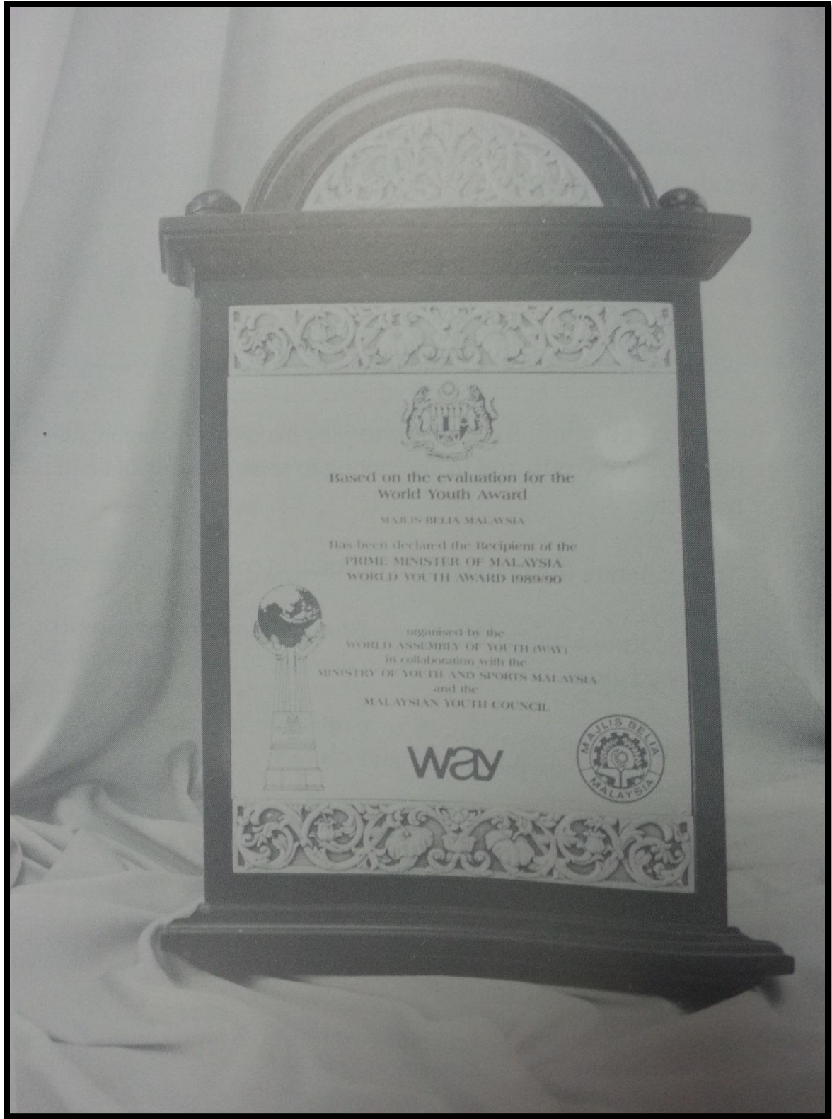
World Youth Award Certificate