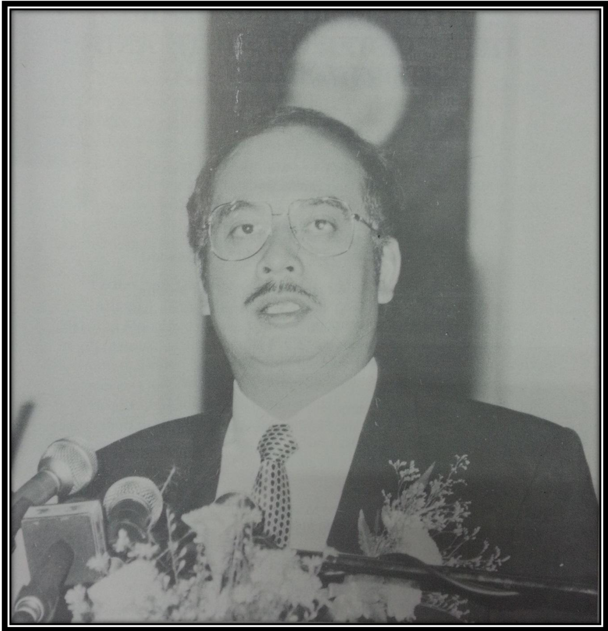
Minister of Youth and Sports, Malaysia Dato's Seri Mohd Najib bin Tun Abd Razak