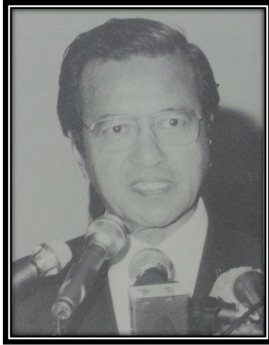
THE RT. HON. DATUK SERI DR MAHATHIR BIN MOHAMED THE PRIME MINISTER OF MALAYSIA

“ What we do today is for them, for the youth who will inherit all the things that have been created today. The future is all about the young people. I am glad that people like me have contributed something for the people who will inherit the world of future. ”