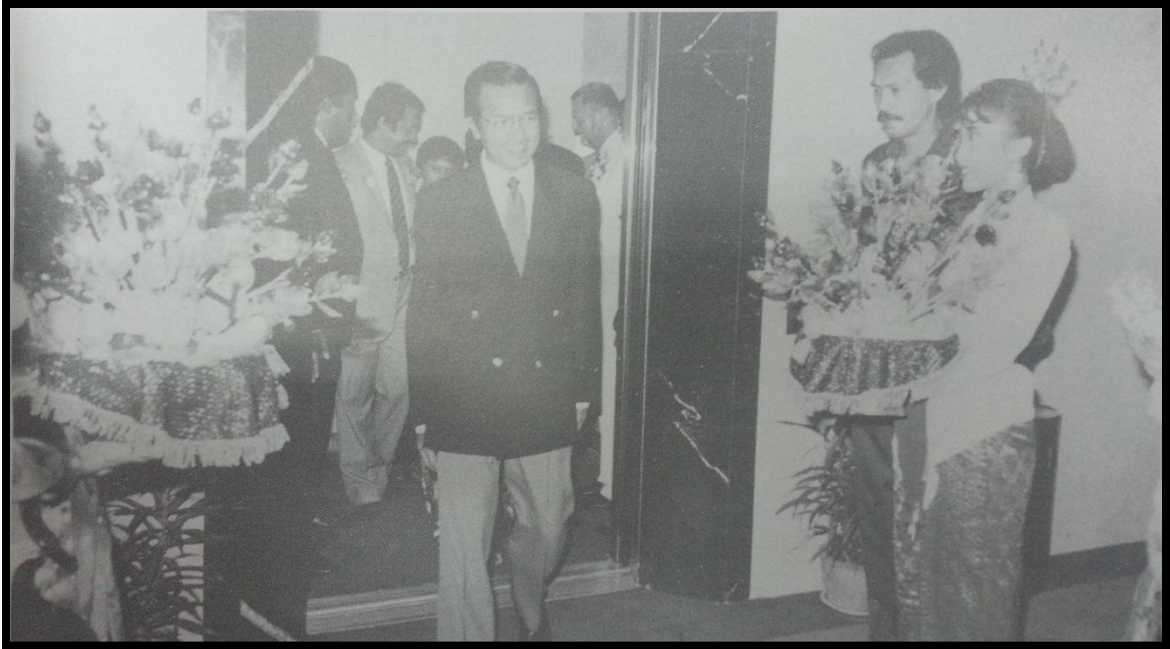
The Prime Minister of Malaysia the Right Honourable Datuk Seri Dr. Mahathir Mohamad being greeted with traditional “Bunga Telur” on his arrival at Subang Villa, Kuala Lumpur.