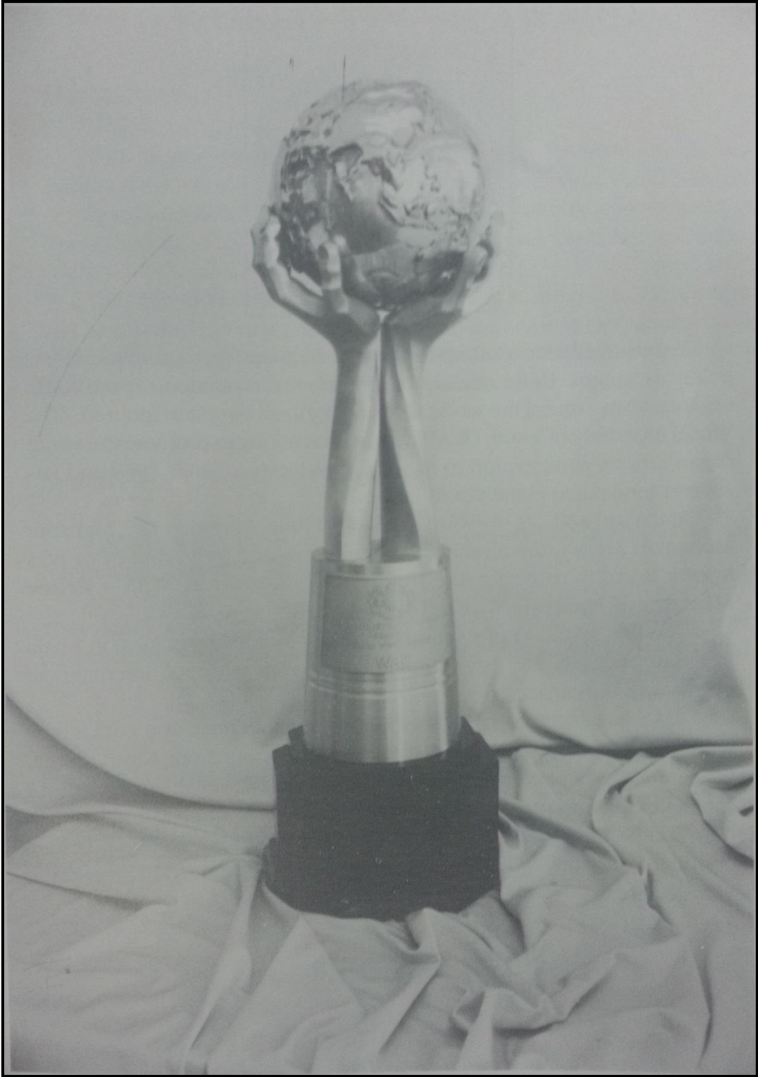
WAY – Prime Minister of Malaysia World Youth Award Trophy