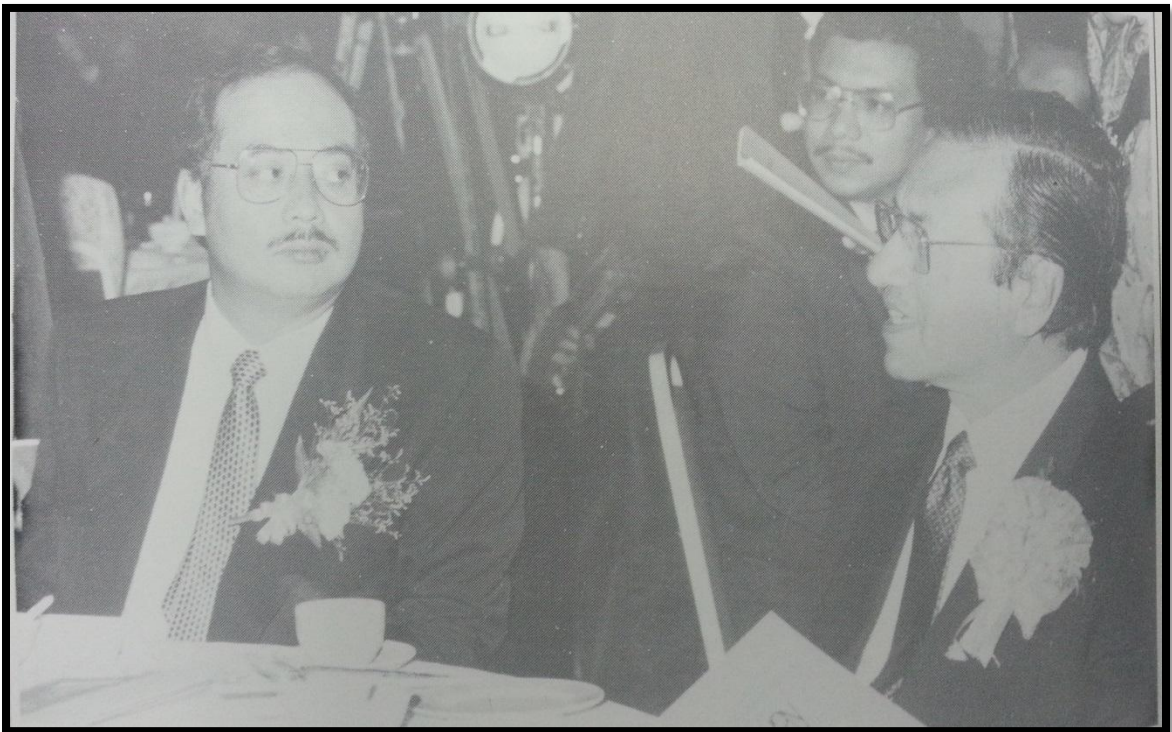
Dato' Seri Mohd Najib Tun Abd Razak listening keenly to Datuk Seri Dr Mahathir Mohamad.