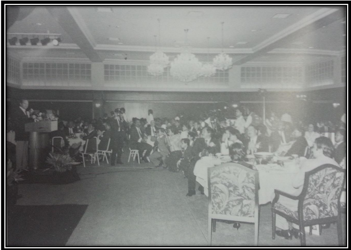
Datuk Seri Dr Mahathir Mohamad delivering his speech during the function.