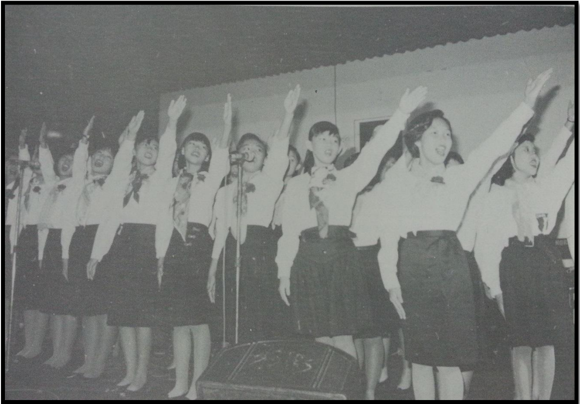
Choir from Sekolah Rendah Subang Jaya singing 'We Are The World'.