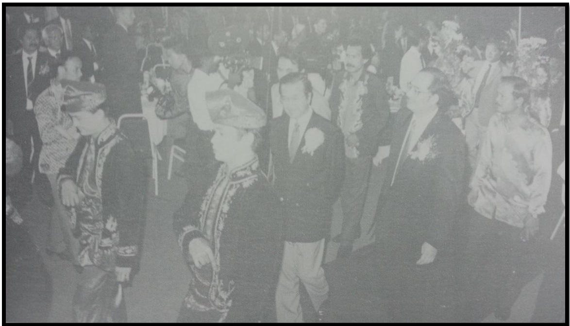
Dato' Seri Mohd Najib Tun Abd Razak, Minister of Youth and Sports Malaysia, accompanying Datuk Seri Dr. Mahathir Mohamad into the Subang Villa Hotel Ballroom.