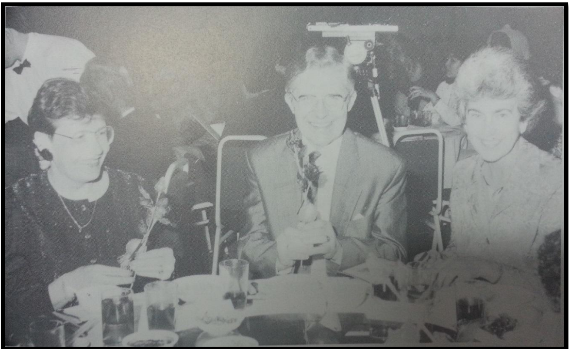
Ambassadors who turned-up for the occasion.